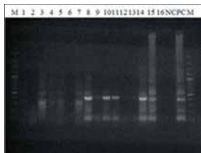
Fig. 1. Gel photograph of primary PCR product showing bands of various sizes. The human serum samples are shown by lanes 1 - 16. NC, PC and M denote the negative control, positive control and 100 bp ladders, respectively.

The prevalence of T. gondii among the workers ( n =6) in the chicken slaughterhouse was significantly higher than among workers ( n =81) in the seven cattle-sheep-goat slaughterhouses (100% v. 34.6%; p =0.003), when these were compared as two different study sites based on type of livestock slaughtered.