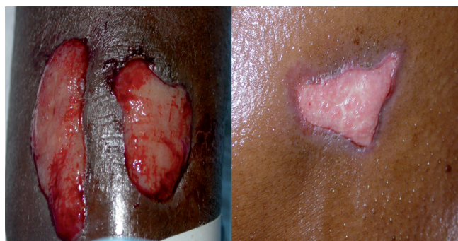
Fig. 1. Lesions at presentation: (left) granulomatous raised ulcers on the elbow; (right) spontaneously healing ulcer on the left side of the neck.

A 31-year-old patient with stage 4 HIV/AIDS presented with recurrent painful skin ulcers for more than 8 months. These would start as subcutaneous skin nodules, later becoming fluctuant and suppurating and then healing spontaneously (Fig. 1). The patient had lesions on the left wrist, left posterior thigh, right axilla, right posterior calf and right upper eyelid. He had also been diagnosed with extrapulmonary tuberculosis and had been on highly active antiretroviral therapy (HAART) for 8 months and antituberculosis medication (continuation phase). After initial poor adherence to both groups of drugs, compliance had improved. The CD4 count at baseline was 16 cells/ \mu\text{l} and the latest result was 80 cells/ \mu\text{l} . Histological analysis of a biopsy specimen taken from the right upper eyelid lesion showed granulation tissue with some acute inflammation. Fungal spores were seen in the exudates and stains revealed 'capsule-deficient' fungi that were first thought to be Histoplasma , and were reported as such.