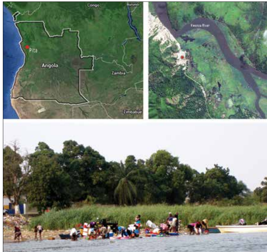
Fig. 1. Pita, Luanda Province, Angola.

Patients underwent CE in the Department of Urology at ABH. CE was performed after the US scan, and particular attention was given to major bladder mucosa alterations such as ulcers, schistosome eggs, granulomas and tumours (14 patients had schistosome eggs and other mucosal changes). A Karl