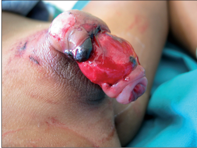
Fig. 2. Post-Plastibell separation and bleeding.

Choosing the correct size of Plastibell is crucial. Hollister advises that a too-small fit can cause tissue strangulation and necrosis, and that using one that is too large may result in too much foreskin being removed and penile denudation.