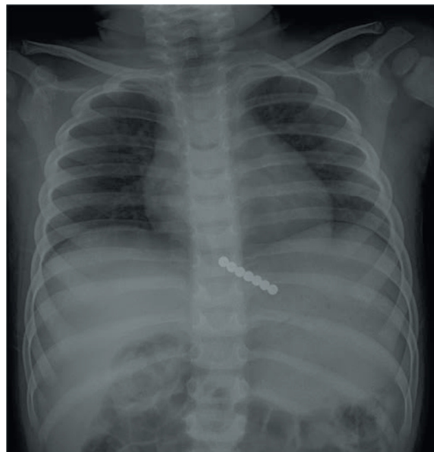
Fig. 1. Chest X-ray showing seven closely approximated beads in a 3-year-old child presenting with abdominal pain. The top two beads were in the oesophagus, while the remaining five were endoscopically retrieved from the fundus of the stomach.

Numerous magnet toys have been implicated in this growing problem, with an estimated 1 700 ingestions treated in emergency departments in the USA between January 2009 and December