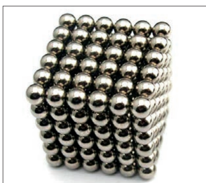
Fig. 3. Magnetic beads.