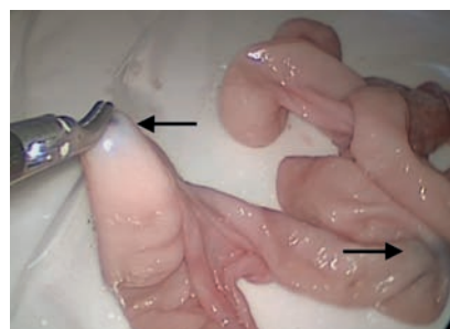
Fig. 5. Simulated model demonstrating attraction between the instrument tip and intraluminal magnet. Arrows indicate the position of the magnets.

and warns consumers to seek medical advice if ingested. Most are made of neodymium, iron and boron or other rare-earth metals and are extremely powerful magnets. The magnetic field typically produced by rare-earth magnets can be in excess of 1.4 teslas. There have been product recalls on certain magnetic toys in the USA because of these issues; however, we are unaware of any such action in South Africa to date.