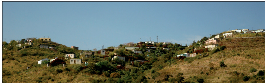
Patients drain from such terrain to far-off, poorly-staffed hospitals.