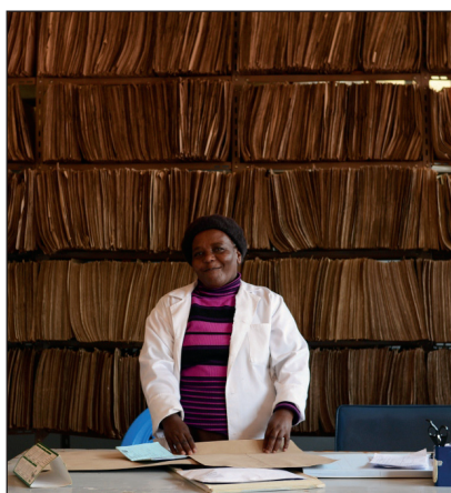
Undaunted. A nurse-clerk with patient files at Lucy's Hospital, Tsolo in the Eastern Cape.