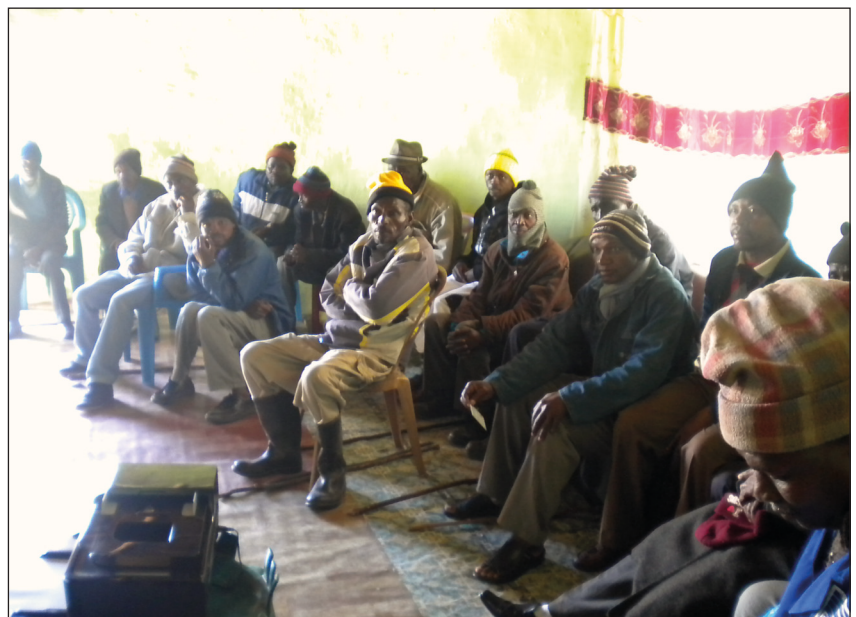
Lesotho mine workers listen attentively to a Mineworkers Development Association briefing.