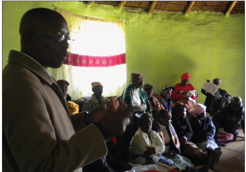
Former mineworkers in rural Lesotho being briefed about the class action.