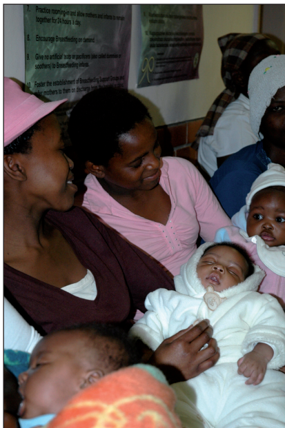
The queue at the ANC clinic at Nkandla District Hospital, deep in rural KwaZulu-Natal.