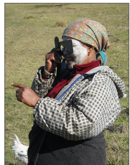
Rural woman does an eye test at the remote Bulungula Lodge near Coffee Bay.

With just 18 in-patient beds they've finally convinced hospital management to provide day-case beds for them (day-case CS is standard at private eye hospitals), addressing one of the three main reasons for procedure cancellations (no consumables, equipment or day beds). Working with the prestigious Australian-founded Fred Hollows Foundation that targets Third-World countries, today they receive regular large consignments of vital lenses, sutures and visco-elastics (a jelly to protect the cornea and keep the eye firm while they operate), plus logistical help in Graaff-Reinet. The Nelson Mandela Metropole (covering Port Elizabeth, Uitenhage and Dispatch) has a drainage of 1.2 million people – giving a strong indication of how close the work of