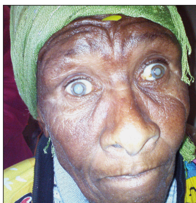
Blinding cataracts in an Eastern Cape woman.