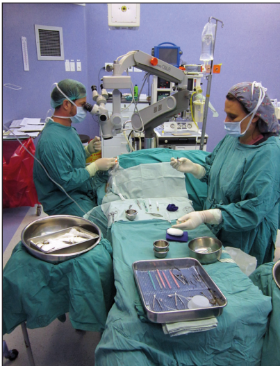
Port Elizabeth surgeons remove cataracts for an indigent patient.

their team is coming to eliminating blindness in their area. From two consultants and three MOs, their department has blossomed to four consultants, four registrars and four MOs, increasing capacity, with the use of a third theatre at Port Elizabeth Hospital now a top priority.