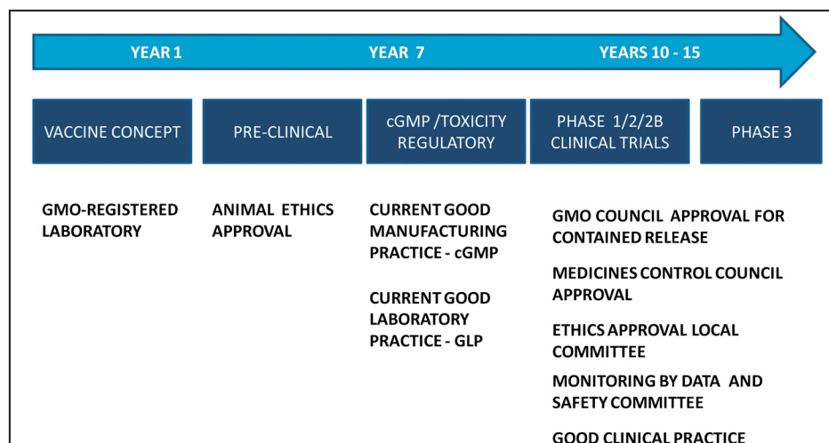
Fig. 2. The regulatory process for moving vaccines from vaccine concept into clinical trials. GMO = genetically modified organism.