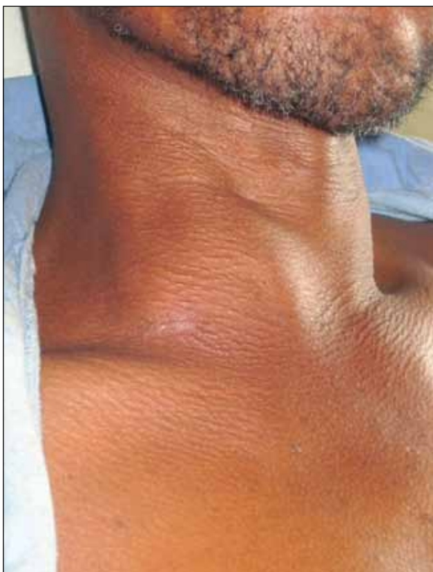
Fig. 1. Photograph showing the patient's large right-sided neck mass.