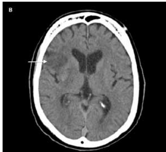
Fig. 2. CT scan of the brain showing infarction in the left temporal region.

Corresponding author: A O Naranbhai (anaranbhai@gmail.com)