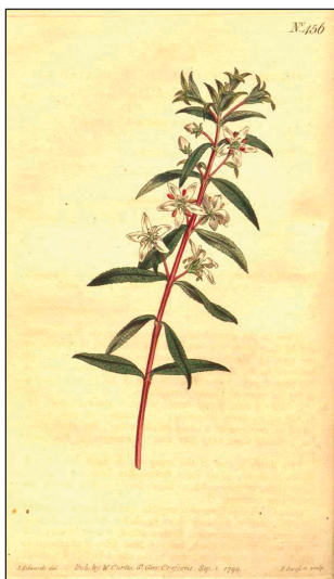
Fig. 3. Longleaf buchu Diosma serratifolia * (Burchell, 1824).

made the next batch of buchu infusion in brandy, 'which faster disappeared than could be accounted for by the wants of my patient'. For 10 days, he washed the hand with the buchu solution twice daily and occasionally thereafter. As soon as the hand began to heal, 'I employed a wash made of a decoction of the leaves of Wilde-alsem ( Artemisia afra ; Wilde-als ; Wild Wormwood)'. 4