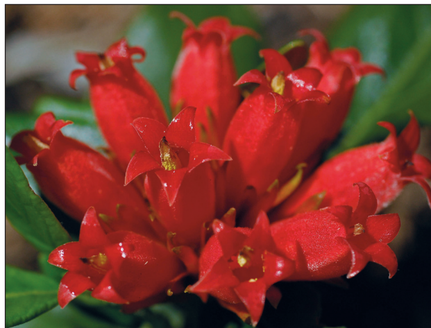
Fig. 1. Flower of Burchellia bubalina .

Burchell is credited with having been the most prolific collector of botanical and zoological specimens, and one of the most scientific of the collectors of that era. In South Africa, he collected 50 000 specimens of plants, seeds and bulbs, and 10 000 specimens of insects, animal skins, skeletons and fish. He painstakingly categorised, described and often drew his specimens; his notes included the exact location, morphological features and habitat of the plants and animals. 2 His botanical collections and catalogue are now at the Royal Gardens in Kew, and his animal collections and catalogues at the Oxford University Museum of Natural History. He was elected a Fellow of the prestigious Linnaean Society when he was only 22 years