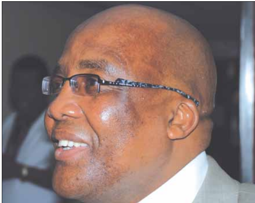
National Minister of Health, Dr Aaron Motsoaledi.

'You have to ask yourself what that will do to the medical aid industry going forward.'