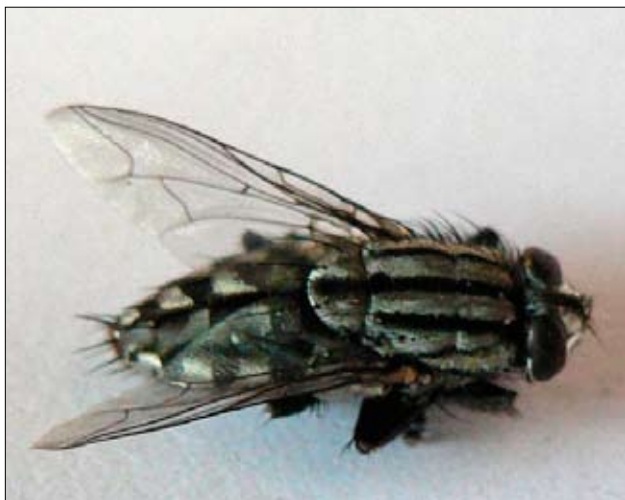
Fig. 2. Sarcophaga ( Liosarcophaga ) nodosa Engel.