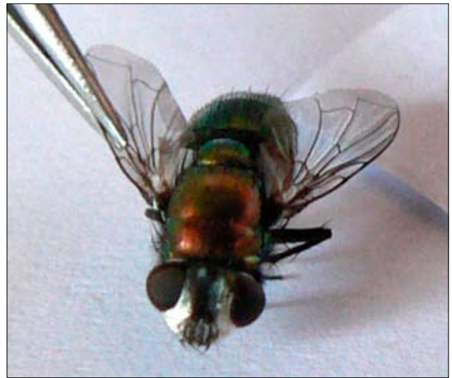
Fig. 3. Lucilia cuprina Wiedmann.

or even in other animals. 6 This is the first time this species has been recorded as causing myiasis in humans. It is possible that there may be many more fly species that can cause myiasis in humans that are still not known. Flies that emerged from maggots collected from the second patient from Slovo Park, Mthatha belong to L. cuprina (Fig. 3). The research project to determine other fly species associated with human wounds in this region is still ongoing.