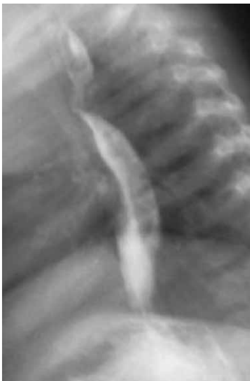
Fig. 1. Barium swallow, lateral view.

A 6-month-old infant presented with a longstanding persistent cough, episodic spells of shortness of breath, gasping-like efforts after feeding, and an unusual noise while breathing, and was reported to have turned blue on two occasions after feeding. A chest X-ray showed significant narrowing of the trachea 2 cm above the carina. An upper gastro-intestinal study (Fig. 1) showed anterior bowing and extrinsic compression of the posterior wall of the oesophagus at the mid-thoracic level, and the trachea was narrowed and showed