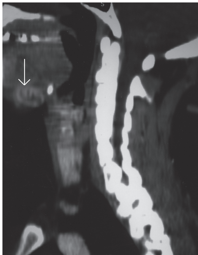
Fig. 1b. Multiplanar reconstruction – sagittal reconstruction of midline neck mass (arrow – ectopic thyroid tissue).

cervical area. 3 In 75% of cases this is the only functioning thyroid tissue. 4