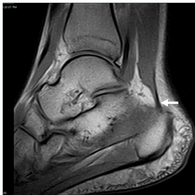
Fig. 2. Left ankle MRI: posteromedial insertion (arrow) of the accessory soleus muscle onto the calcaneus via a thin tendon.