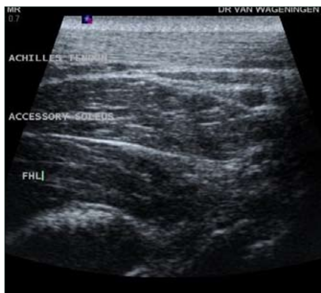
Fig. 1. Ultrasound of left accessory soleus muscle: same echogenicity and appearance as the underlying flexor hallucis longus muscle.

Corresponding author: EW Derman ( wayne.derman@uct.ac.za )