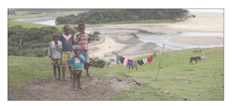
Children at their remote Bulungula River mouth home in the Eastern Cape.

A small band of energetic community service doctors in harness with a 'fixer' colleague in the Eastern Cape health department are performing deep rural health care delivery miracles in the face of corrupt, careless and dysfunctional administration.