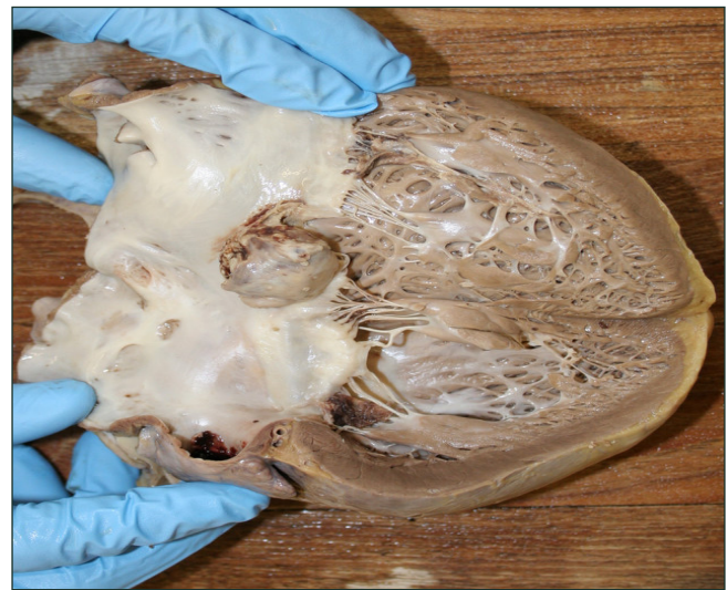
Fig. 1. Large fibrous nodular mass in the mitral valve cusp.

A 21-year-old man had been nauseous and vomiting for one day, and had bought Gaviscon; he collapsed and died while vomiting into a toilet. He was thin but not emaciated. At autopsy, cardiomegaly was evident, with a firm, hollow, yellowish mass with a thrombus within the cavity, just below the aortic outflow tract in the left ventricle. The aortic valve cusps had been replaced by the mass. The lungs were normal and the lymph nodes enlarged. The subject's HIV status was not ascertained. No acid-fast bacilli were noted on Ziehl-Neelsen staining.