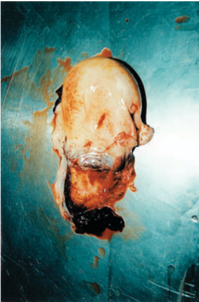
Fig. 2. Case 2. Blood clot in the uterine cavity.

be filled with blood (Fig. 2). The cause of death was ascertained to be haemorrhagic shock.