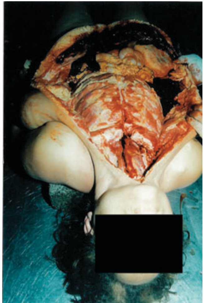
Fig. 3. Case 3. Blood in the pelvic cavity.

A 24-year-old woman, gravida 7 para 4+2, was admitted for elective caesarean section on 4 April 2001. A lower segment caesarean section was carried out successfully, with a live baby