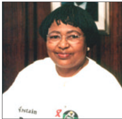
Health Minister, Dr Manto Tshabalala-Msimang.

Health Minister, Dr Tshabalala Msimang, told a delegation of SAMA doctors in February this year that they were 'just one of many' groupings in the public health sector.