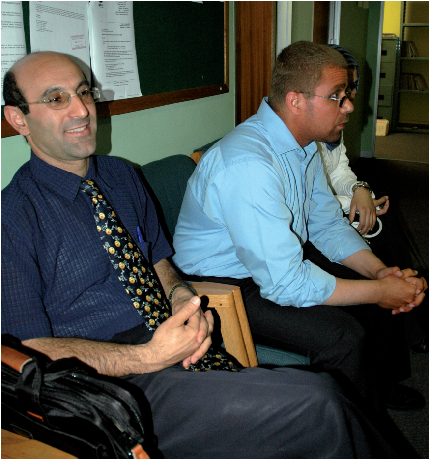
Foreign qualified doctors queue up at the Health Department's Foreign Workforce Management Programme offices in Pretoria in 2006.

An investigator from the police's organised crime branch in Pretoria was last month scouring three provinces, tracing payments allegedly made to a health department deputy director by foreign doctors desperate for hospital placements.