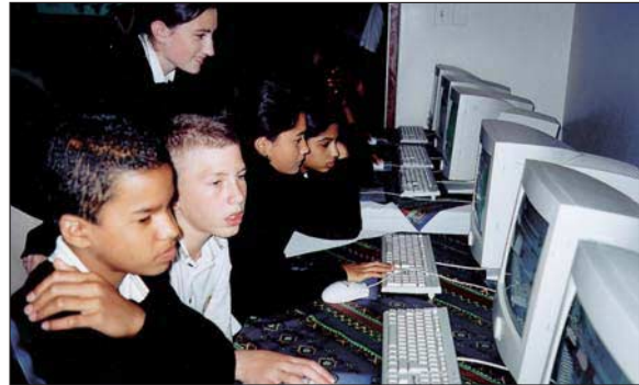
Schoolchildren learn to navigate their way around the MRC portal.

After spending time perusing the various sections dealing with the clinical and epidemiological and other issues concerning HIV/AIDS, one can go to the 'Gateway Links' which supplies a fairly good list of the major HIV/AIDS sites. I hope that the webmasters will add 'Red Ribbon', 'HIV InSite