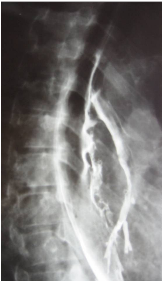
Fig. 1. Oesophago-bronchial fistula.

few patients were seen at a tertiary referral gastrointestinal unit, which could be explained by poor referral practices. The latter seems unlikely as we have an open-access endoscopy policy for HIV-infected patients and good community networks. Our study confirms that oesophageal ulceration occurs in patients with severe immunosuppression where 81% of patients had a CD4 count \leq 100 cells/ \mu l. South African HIV-positive patients may succumb to TB and other opportunistic infections before achieving this degree of immunosuppression.