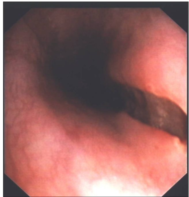
Fig. 2. Idiopathic oesophageal ulcer.