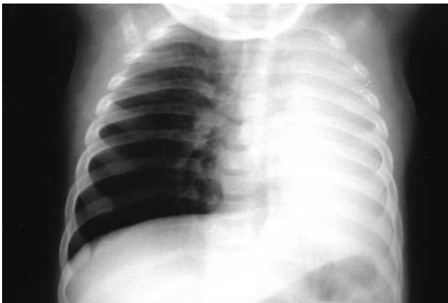
Fig. 1. Admission mobile supine chest radiograph showing complete opacification of the left hemithorax, mediastinal deviation to the left and an over-expanded right lung herniating across the midline.

With a presumptive diagnosis of foreign-body obstruction, urgent bronchoscopy was performed. The trachea was mildly inflamed, showing minimal clear secretions and there was