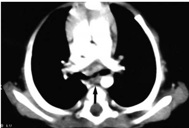
Fig. 4. Contrast-enhanced axial CT scan of the chest just below the level of the carina, showing subcarinal adenopathy (arrow).