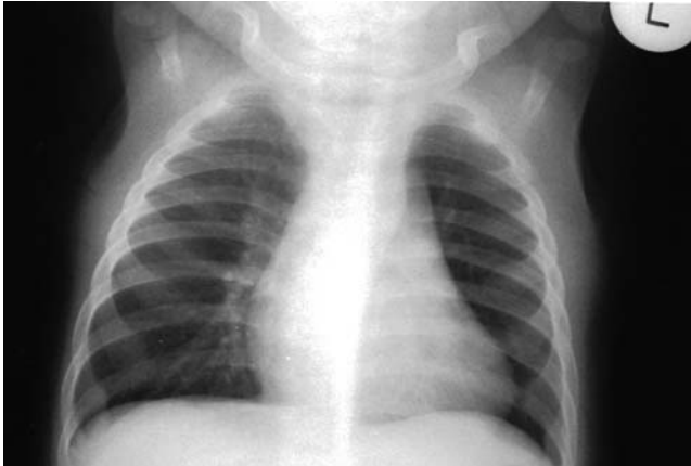
Fig. 3. Normal follow-up AP chest radiograph one day after admission.

Bronchial lavage proved negative for acid-fast bacilli and other micro-organisms, but the Mantoux skin test was reactive.