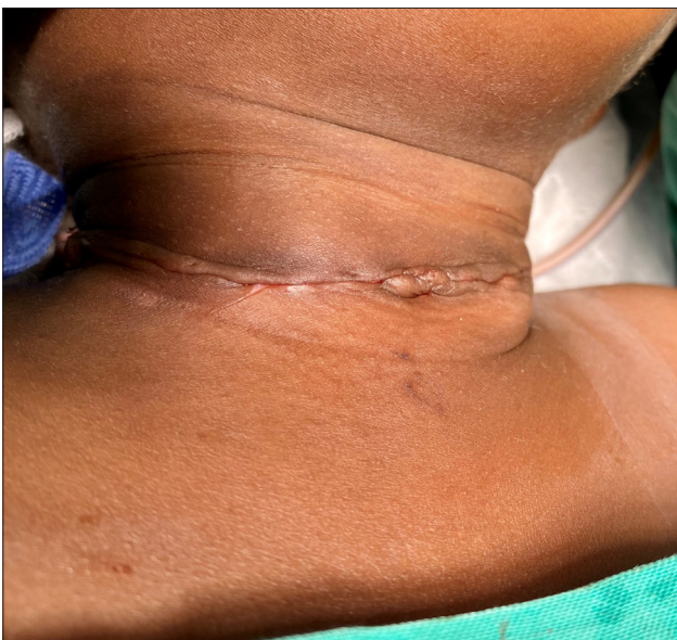
Fig. 4. Aspect of the anterior neck after closure of the skin.