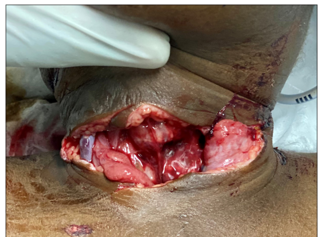
Fig. 1. Initial aspect of the anterior neck area on presentation.

In theatre, the patient was placed in a supine position with the neck hyperextended. After draping, a neck exploration was performed, and the findings of the surgery were a completely severed right and left anterior neck triangle sternocleidomastoid muscle with 60 - 70% of the trachea circumference severed anteriorly (Fig. 2). The carotid arteries and jugular veins were both bruised, but not actively bleeding. The nerves and other organs of the anterior triangles such as the thyroid and thymus were all spared. The operative area was mechanically cleaned and irrigated repeatedly with saline, following which the trachea was sutured and repaired with 7 interrupted sutures using Vicryl 3.0 on a round needle (Fig. 3). Both the left and right anterior neck triangle muscles were approximated with Vicryl 3.0 and finally the skin was closed with Monocryl 4.0 (Fig. 4). The patient was taken to the paediatric intensive care unit (ICU) and intubated for both ventilation and stenting the trachea for 5 days.