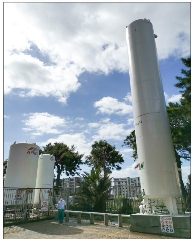
Fig. 3. Oxygen storage tanks at Groote Schuur Hospital.

Caring for this patient was significantly less costly, easier and associated with fewer complications than if she had been admitted to an ICU or ventilated. She was nursed in a six-bed cubicle in an open ward, with minimal extra staff allocated to her care. She was able to feed and prone herself, move her nasal interface, and use a bedpan with minimal assistance. Hospital complications for such an ill patient were minimal because of the use of HFNO – she was awake, developed no bedsores or other complications possible in