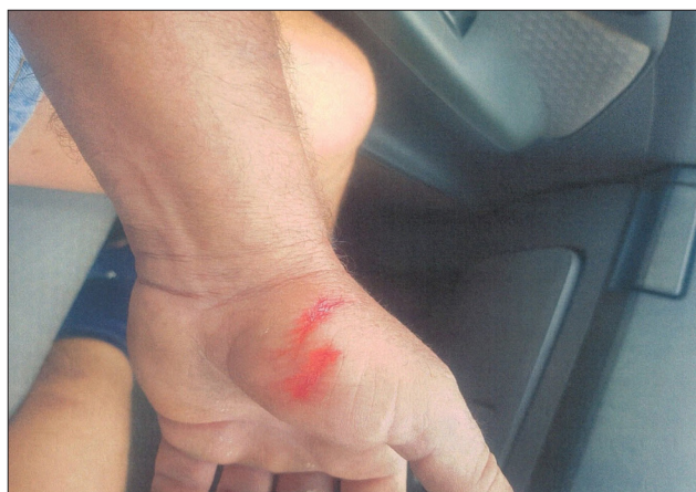
Fig. 2. The unremarkable bite site on the left hand of the patient, with some blood oozing from the puncture wounds.

Boomslang venom and warfarin may have potentially interacting effects on coagulation and clinical bleeding based on their respective mechanisms of action. Two scenarios may be considered: firstly, overall bleeding is reduced, or secondly, bleeding is compounded and exacerbated. The first scenario stems from the rationale that the mechanism of anticoagulation induced by warfarin is mediated through the reduction of functional levels of vitamin K-dependent clotting factors. This reduction may paradoxically have a protective