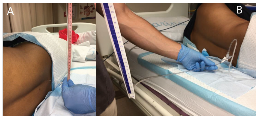
Fig. 1. A: CSF OP measured using the IVGS strapped to a measuring tape. B: The standard method of measuring CSF OP using the spinal manometer with the patient in the left-lateral position. Each set of tubing was made to communicate with the needle separately without flow into both tubes at the same time. (CSF = cerebrospinal fluid; OP = opening pressure; IVGS = intravenous giving set.)

Descriptive statistics were used to summarise the data. Continuous variables were summarised by means (standard deviations (SDs)) and categorical data by frequencies and percentages. Pressure measurements were taken by two methods on the same patients. Data were analysed by comparing first all measurements and then measurements by their order of administration. Paired t -tests were used to compare the two pressures. Pressures were then dichotomised at ≤25 cm and >25 cm. McNemar's \chi^2 test was used to test their agreement. Pearson's correlation was used to measure the strength of the association between the two measure-