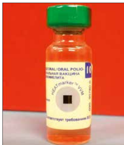
A vial of polio vaccine, with its vaccine vial monitor indicating that it has expired.

S Afr Med J 2016;106(4):318-319. DOI:10.7196/SAMJ.2016.v106i4.10765